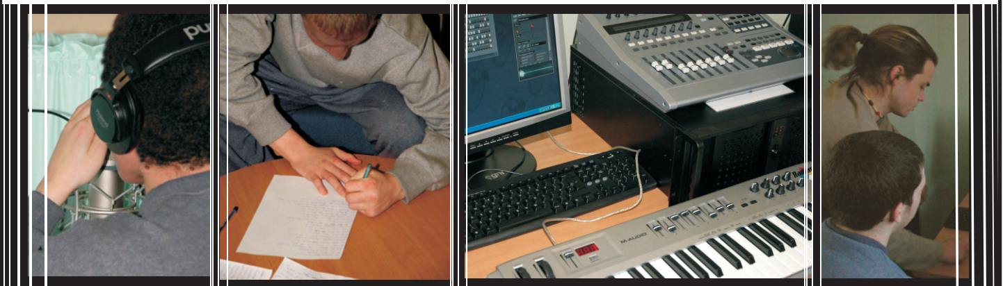
Lyric writing and music technology workshops at Werrington Juvenile Centre

The project also took place at HMPYOI Swinfen Hall with week long residencies in January 2007, Summer 2008 and Autumn 2009 and continues to run at this institution.