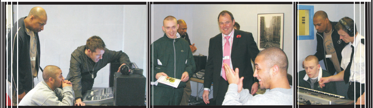
Hard at work at Brinsford HMPYOI

Sonic db has already been successful in HMPYOI Werrington, HMPYOI Drake Hall and HMPYOI Brinsford with positive outcomes around team work, skills development and creativity.